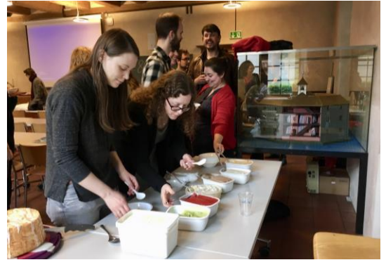
Pride and Prejudice Movie Marathon