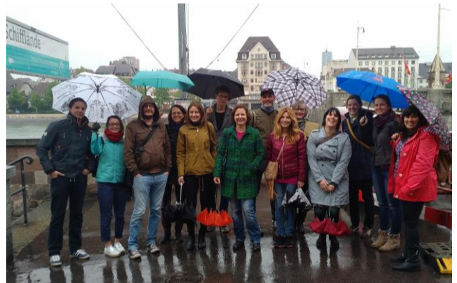
Staff excursion to Schweizerhalle