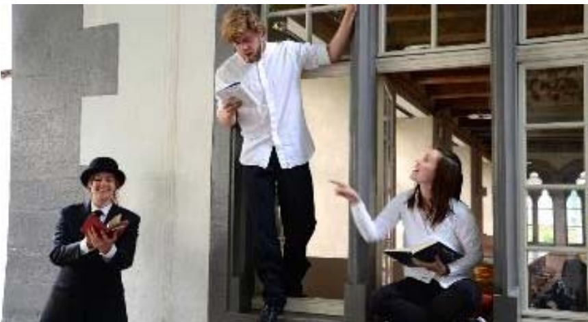
Members of the Gay Beggars at the Bloomsday Party on 16 June 2014

Members of the Gay Beggars also contributed to the Bloomsday party.