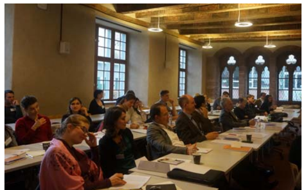
SANAS Conference in November 2014