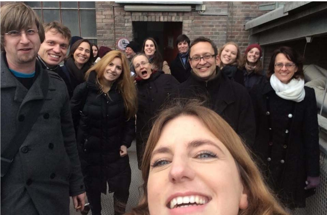
Seminar excursion to the port of Basel on 28 November 2014