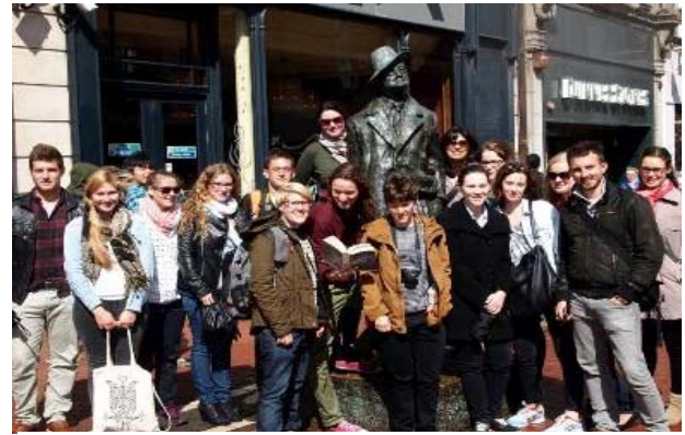
Participants of the excursion to Dublin in August 2014